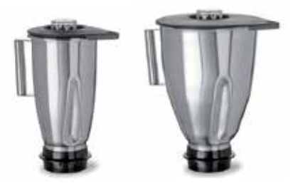
Stainless steel 2I, very robust, for highest demands on hygiene.