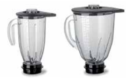
Polymer 2I or 4I, light, handy, transparent, stackable (2I), with scale.

The big 4 liter jars, made of stainless steel or polymer, are ideally suited for the preparation of larger quantities of salad dressings, warm sauces, mayonnaise, porridge, soups, custards, cake batters, but also for smoothies, fruit drinks, cock-tails, milkshakes etc. For smaller amounts, jars with a capacity of 2 liters, made either of polymer or stainless steel, are available. The high performance blades even crush ice cubes to frozen snow.