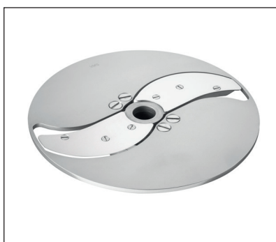
Adjustable slicing disc cutter 0–8 mm with a pulling cut