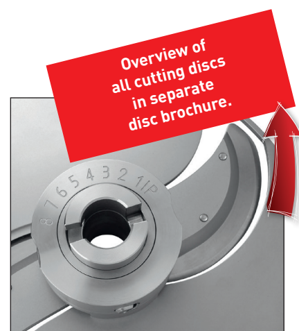
Easy adjustment of the cutting thickness without tools.