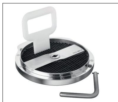
Dicing disc with knife, cleaning tool, and knife removal tool

The slicing discs and dicing blades have two blades.