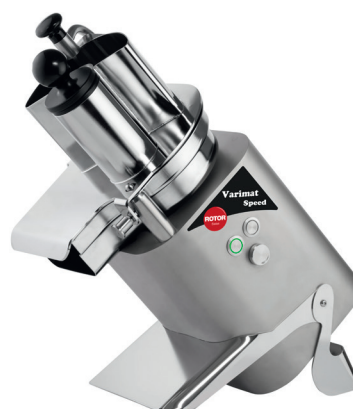
Vegetable slicer Rotor Varimat Speed Gourmet with variable speed

For even higher demands on performance and versatility, we offer an equally compact alternative: